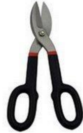
10" TIN SNIPS