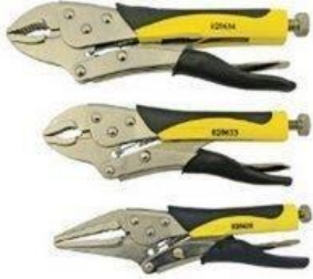
3 PC CUSHION GRIP LOCKING PLIERS SET