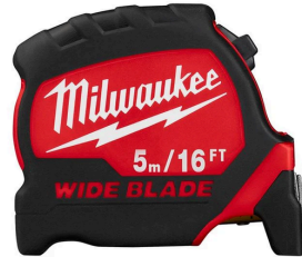
5M/16FT WIDE BLADE TAPE MEASURE