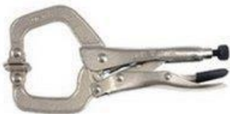
6" LOCKING C CLAMP PLIER