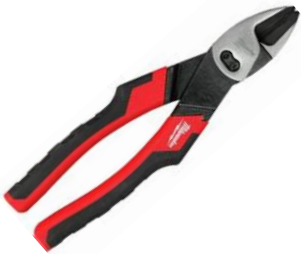
8" DIAGONAL PLIERS