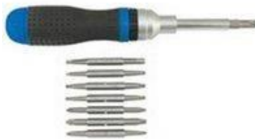
19PC RATCHET DRIVER